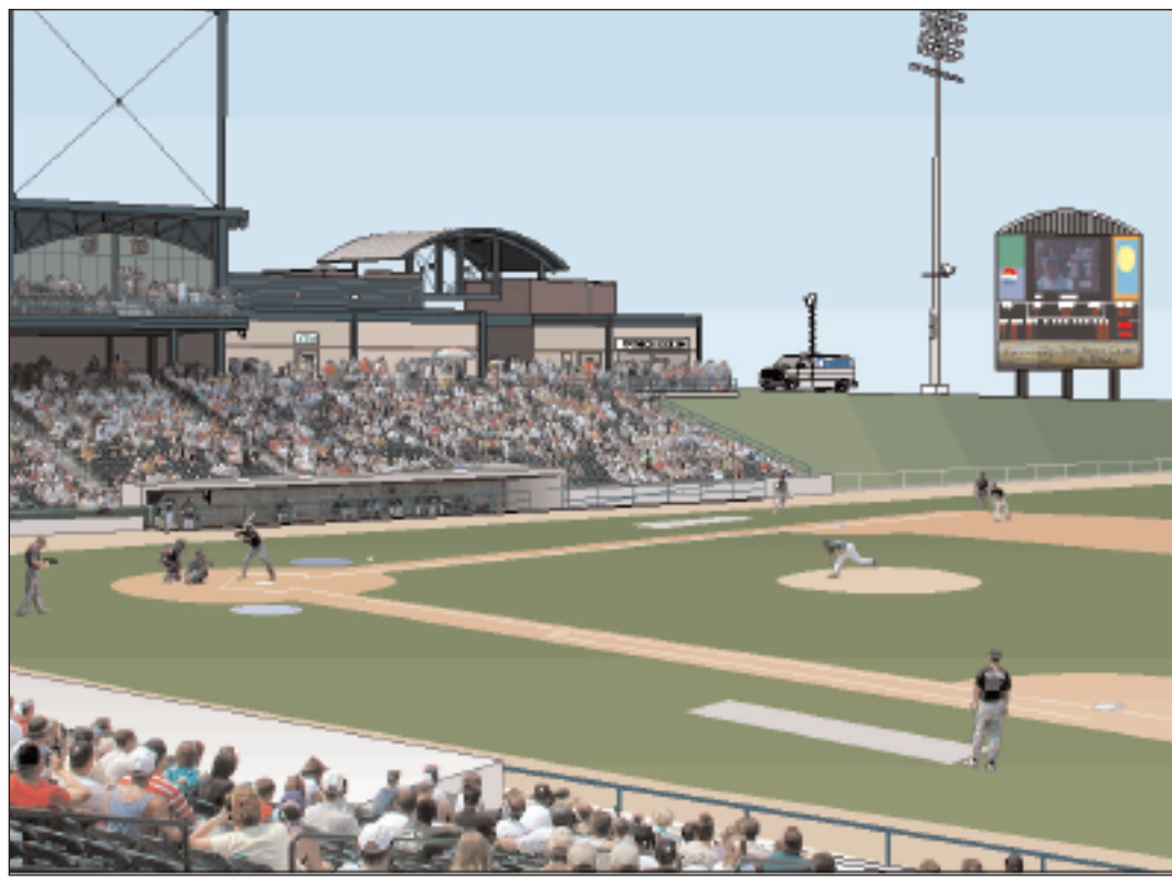
Ball Park - outdoor system connections